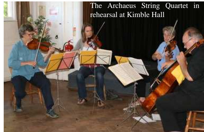
The Archaeus String Quartet in rehearsal at Kimble Hall