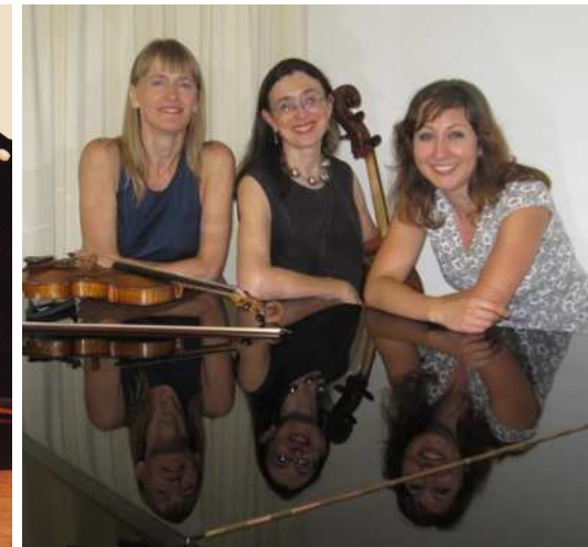
The Solarek Piano Trio