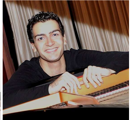
The Wiener Mozart Trio